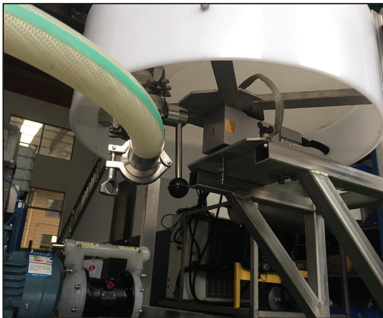
Liquid methionine can be dosed using a scale comprised of load cells and a weigher tank. Mainflo