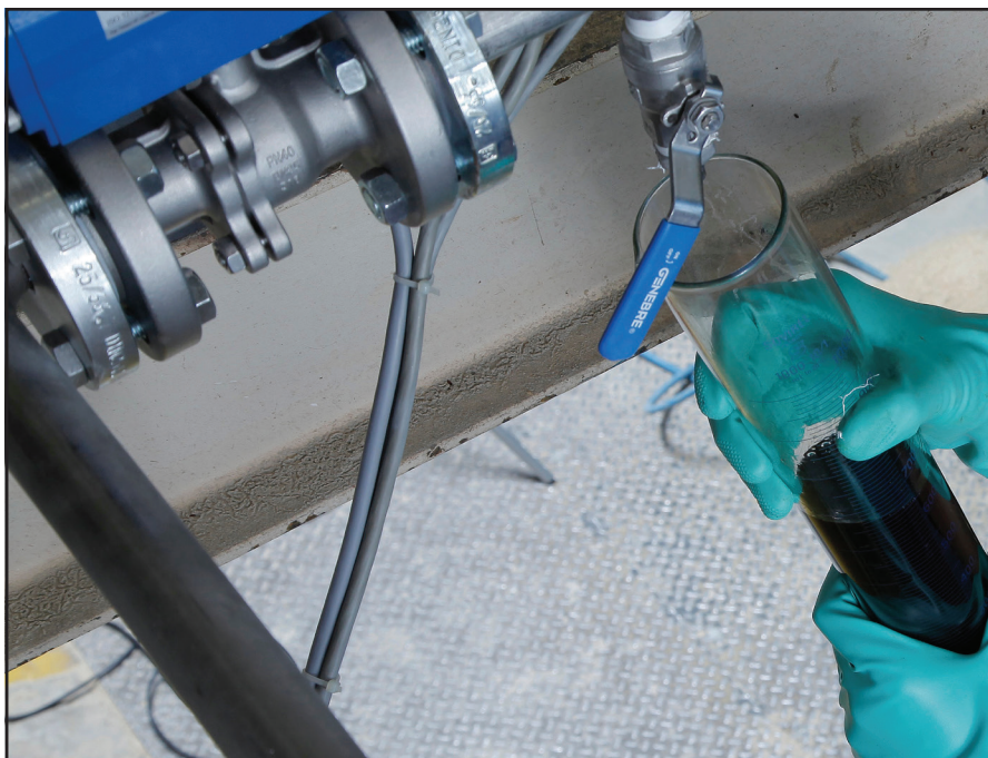
The control of flowmeters should be performed one to two times a year. Adisseo

Any apparent leakage of product should be fixed as soon as it is detected. The affected surfaces — pipes, pumps, floor — should be cleaned immediately. In most cases, warm water is sufficient.